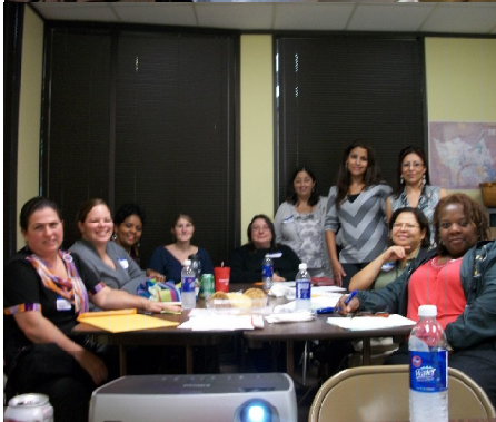
Aldine ISD educators are pictured taking part in the September 9th Classroom Management workshop. Attendees received new tools to assist with classroom activities and CPE credit.

with the approval of district personnel. The union is also proposing that employees would have input in the types of professional development they are seeking, and then create workshops to meet these demands.